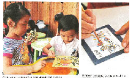
MALAY MAIL (REAL SPACES)

Guests enjoy cooking activities and food at company's Bukit Puchong sales gallery