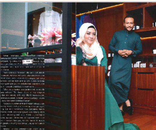
MINGGUAN WANITA (CERITA MUKA DEPAN)