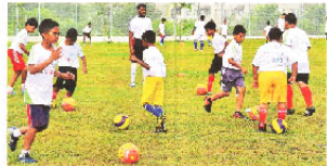
THE STAR (STARMETRO - SPORT)

Former England and Liverpool star leads community football clinic