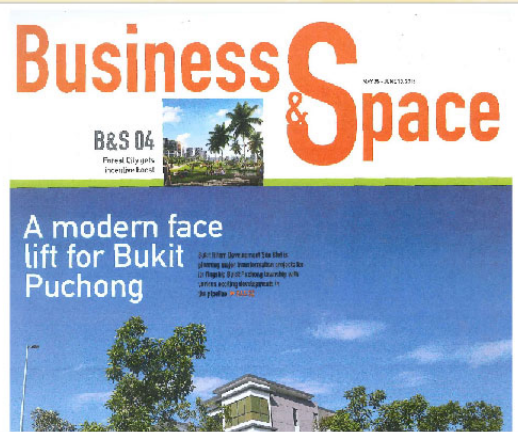
MALAYSIA SME (BUSINESS & SPACE)